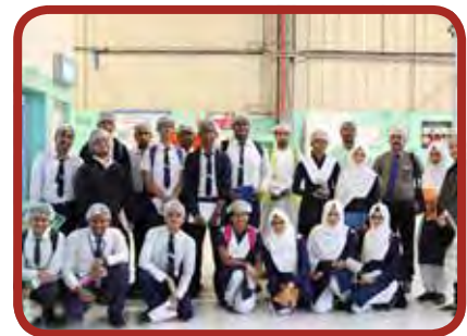
Teachers' Day Celebration