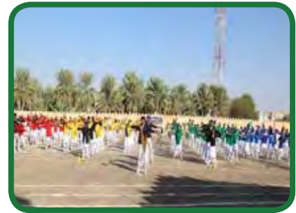
PT Display during Sports Meet