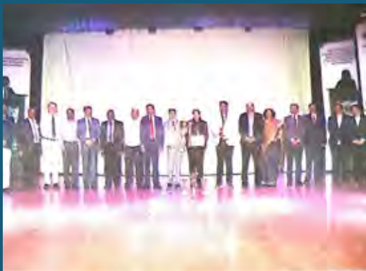
INTER SCHOOL DEBATE: The debate was themed on the 150th birth anniversary of Mahatma Gandhi.