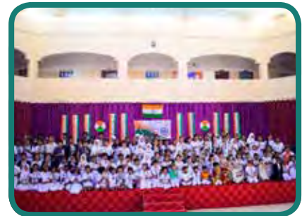
Republic Day Function