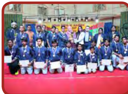
Annual Sports Champions