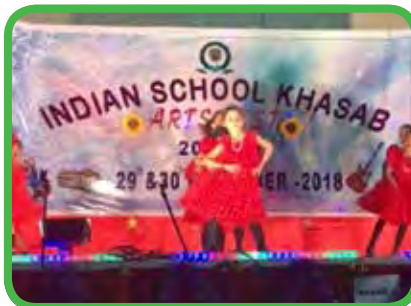
Annual Arts Day