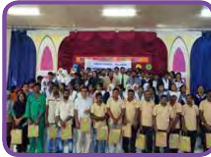
Charity by YCIS