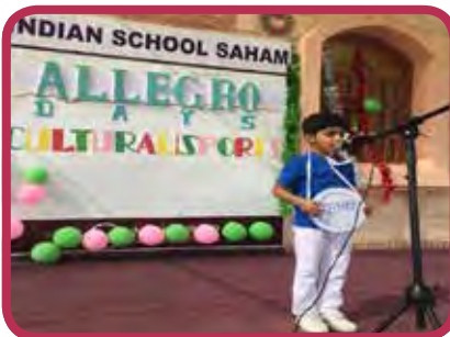
'Allegro' Cultural Fest