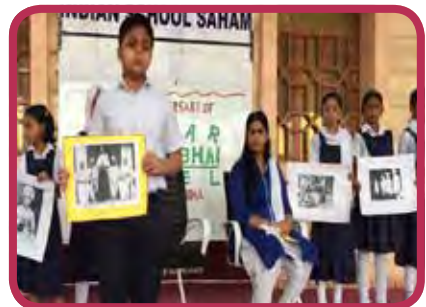
Birth Anniversary of Sardar Vallabhai Patel