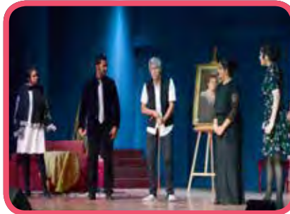
Interhouse One Act Play Competition