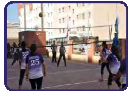
Annual Sports Meet