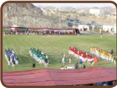
Annual Athletic Meet