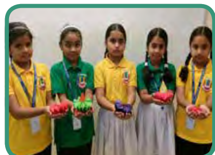
Children at Craft Work