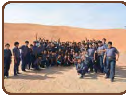
Scout & Guides Camp