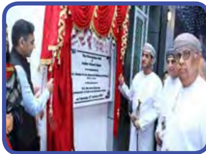
Inauguration of Recreation Hall