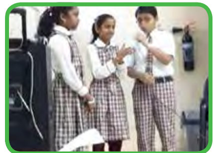
Republic Day Quiz Program