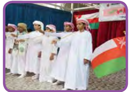
National Day Celebration