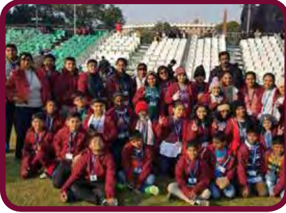
ISM team on Republic day at Delhi