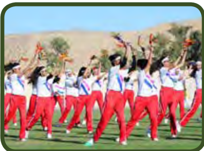
Annual Sports Day