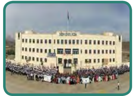
National Day Celebration