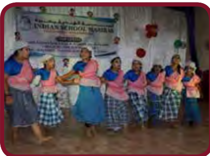
Children's Day Celebration