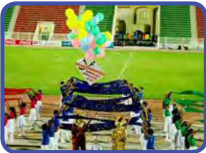
Annual Sports Day