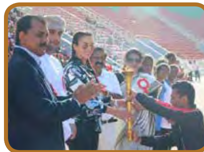
Annual Athletic Meet