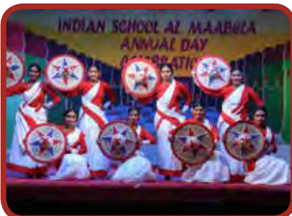
Annual Day Celebration