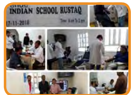
Blood Donation Drive