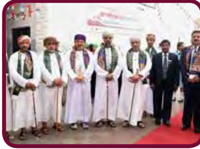
48th National Day Celebration