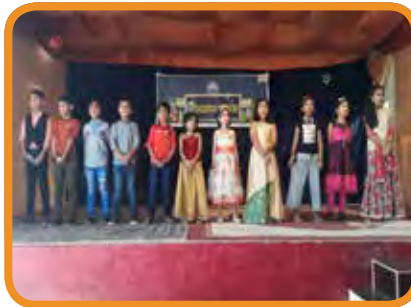
Children's Day Celebration