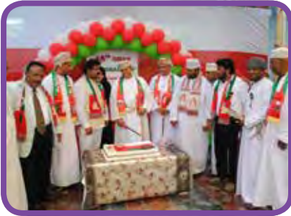
National Day Celebration