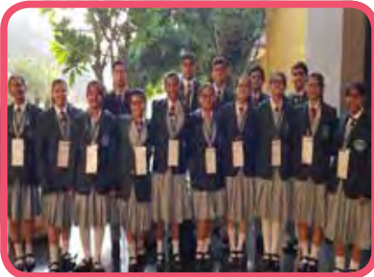
At Round Square Conference, Mumbai