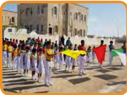
Annual Sports Meet