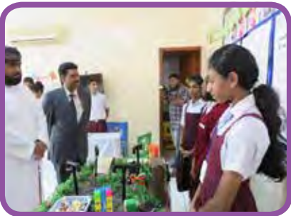
Annual Exhibition 2019