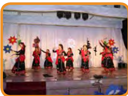
Annual Day Celebration